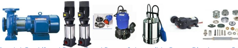
Vertical & Horizontal Centrifugal Pump, Sand Pump, Submersible Pump, Diaphragm Pump, pump & motor spare parts.