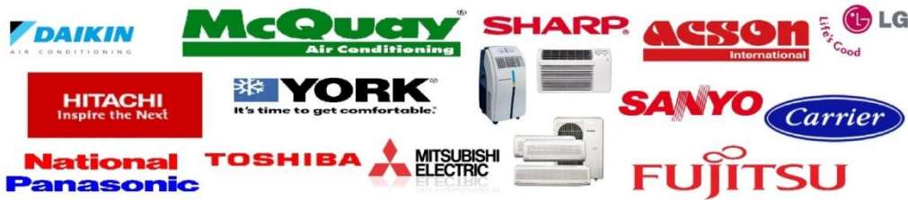
We supply the air conditioner unit and its spare parts for the well known brand, Daikin, Hitachi, National Panasonic, Mc Quay, Sharp, Toshiba, Mitsubishi, York, Sanyo, Acson, LG, Carrier and Fujitsu.