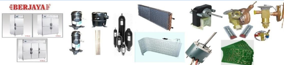
We dedicated our supply in Berjaya refrigeration and its spare parts. We also supply the common spare parts for other brands of refrigeration unit as example, compressor, accumulator, evaporator coil, condenser coil, Printed Circuit Board (PCB), digital thermostat, fan motor, capillary tube and expansion valve.