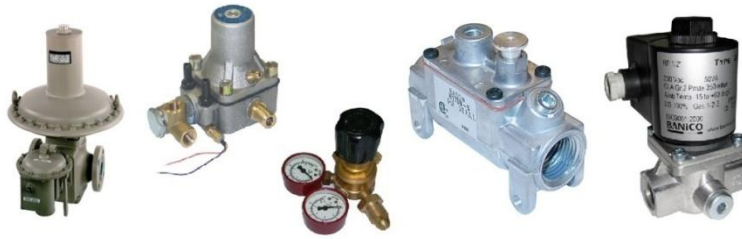
Pressure Regulator, Shut off Valve, Ball Valve and Safety Valve.